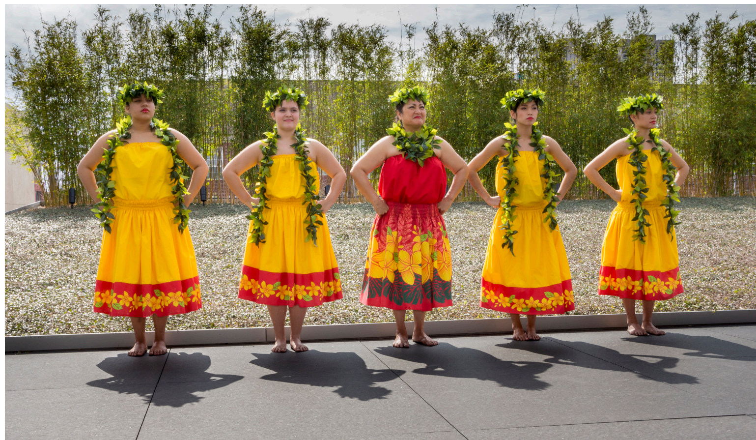
The Center is a backdrop for cultural events and community gatherings.