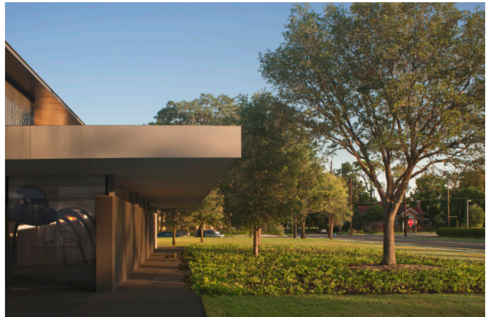
The architecture and landscape work together to blur the line between indoors and outdoors.