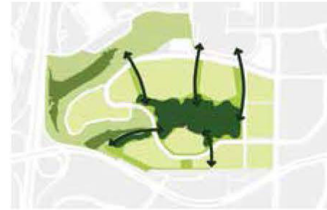
Strengthen Mesa's connection to the larger landscape