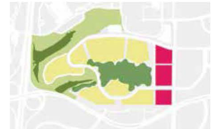
Create a new mixed use gateway on Regents Road