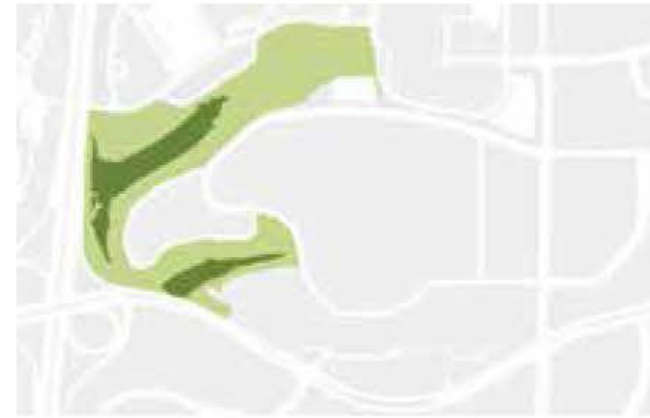
Extend the canyons into the site