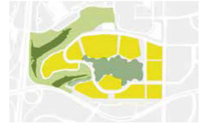
Define a clear development framework