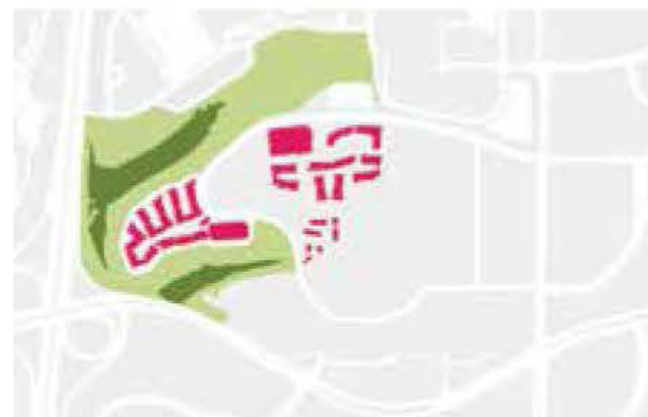
Integrate buildings to remain