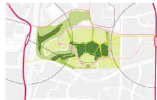
Create a transit rich neighborhood