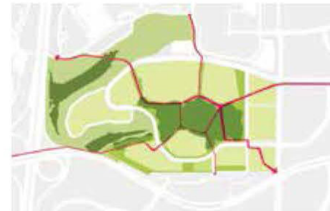
Connect the entire neighborhood through a dedicated pedestrian network