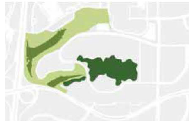
Transform the existing eucalyptus grove into a central park