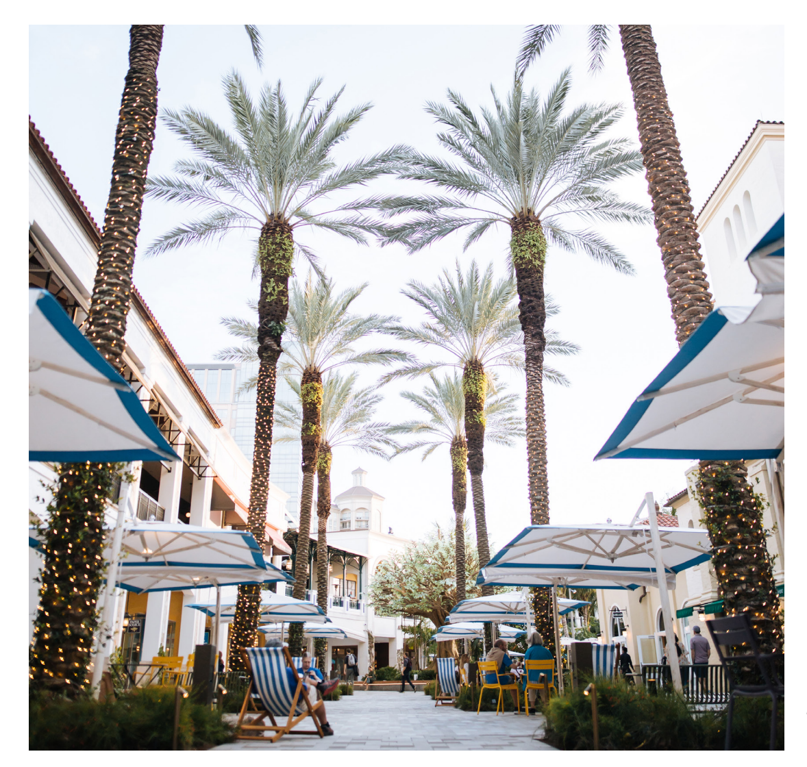
Canopied seating along the site provide guests with space to rest, dine and socialize comfortably.