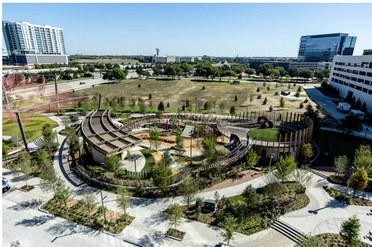
The pool deck of the Hall Park Hotel overlooks Kaleidoscope Park in Frisco.

Oct. 31, 2024 | Published 6:00 a.m. | 6 min. read