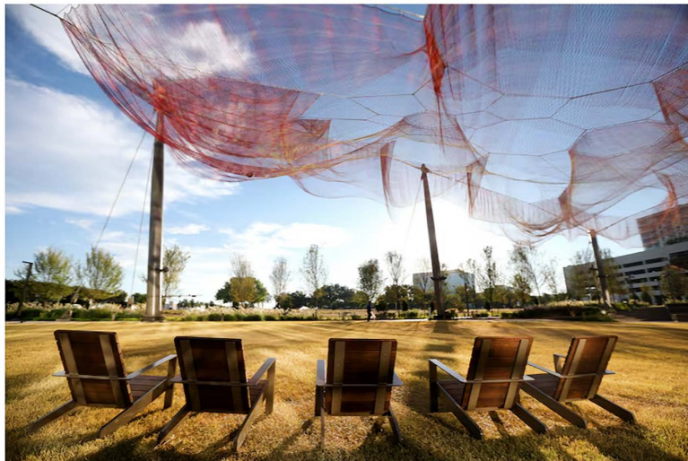
Kaleidoscope Park in Frisco.

Other plantings around the park offer what Trageser calls a "rich North Texas botanical experience." Of note are the "rain gardens" along the park's southern boundary that capture and filter rainwater that is then stored underground. Cypress, elm and oak trees provide shade and line the park's winding paths; as they grow, they will dramatically enhance its character.