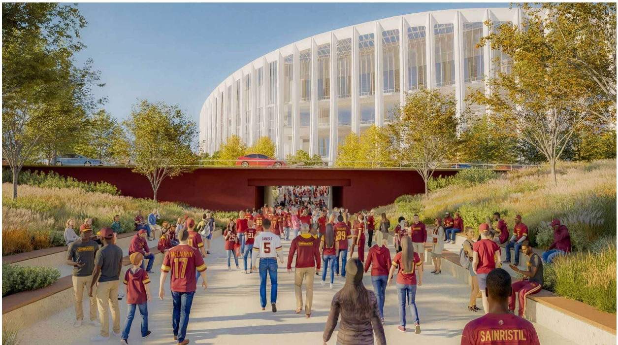
From the south, fans and spectators will enter the stadium passing underneath a raised highway.