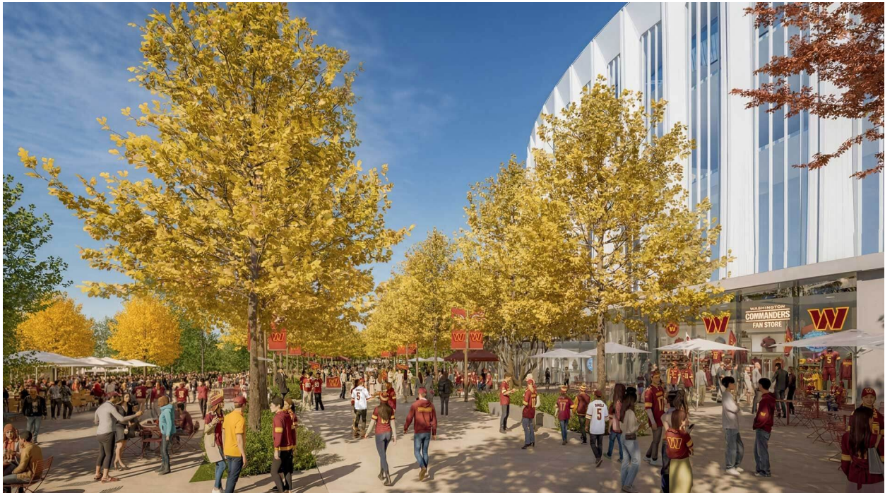
A promenade will connect plazas to the east and west.

The tranche of renderings by HKS was issued in March . Visuals showed the stadium’s form and how it will appear from East Capitol Street Northeast, the Whitney Young Memorial Bridge, and East Capitol Street Southeast.