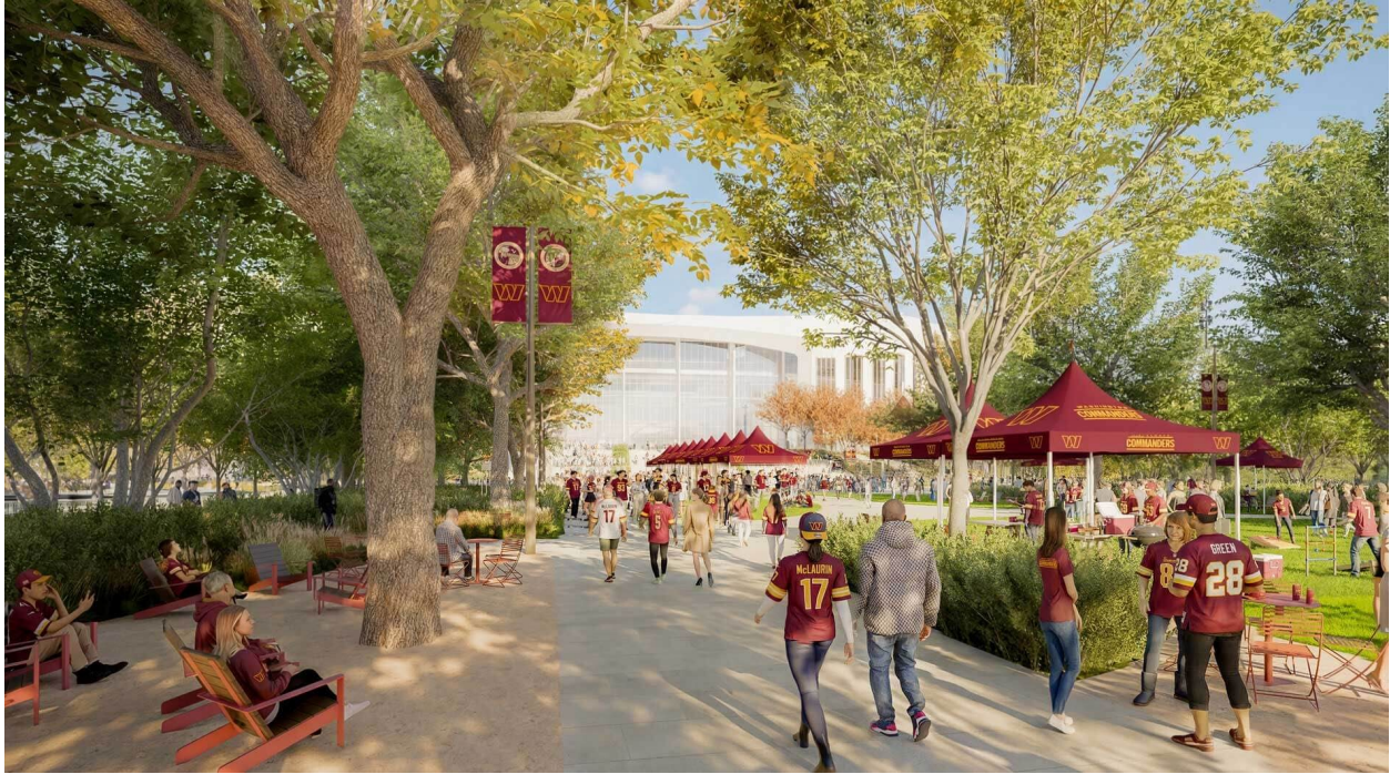
The festival plaza will be used for tailgating on game days and can be used for other activations year-round.

Central to the overall design is what OJB calls the Festival Plaza at 22nd Street Northeast. This will become the area's "front porch," OJB said, and host seasonal markets, watch parties, performances, community events, and, of course, tailgating.