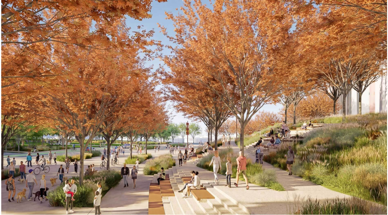
To accommodate the site's natural topography, steps will be built into the west.